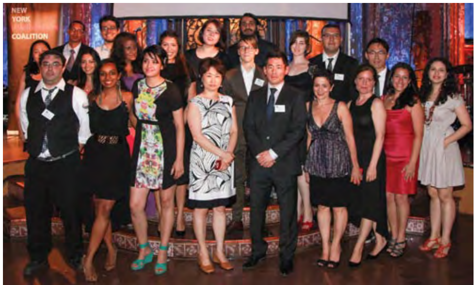
NYIC STAFF AT THE 2013 BUILDERS OF A NEW NEW YORK CELEBRATION

Consultant, Service Structures and Legalization